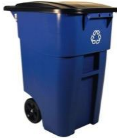
Recycling 50 gal