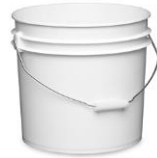
Liquids 3 gal