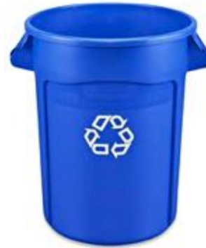
Recycling x2 32 gal