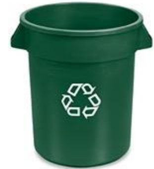
Compost x4 32 gallon