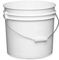
Liquids 5 gal