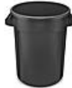
Landfill/Trash 32 gal