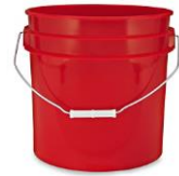
Flatware 3 gal